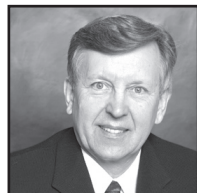
Albin H. Gess Intellectual Property